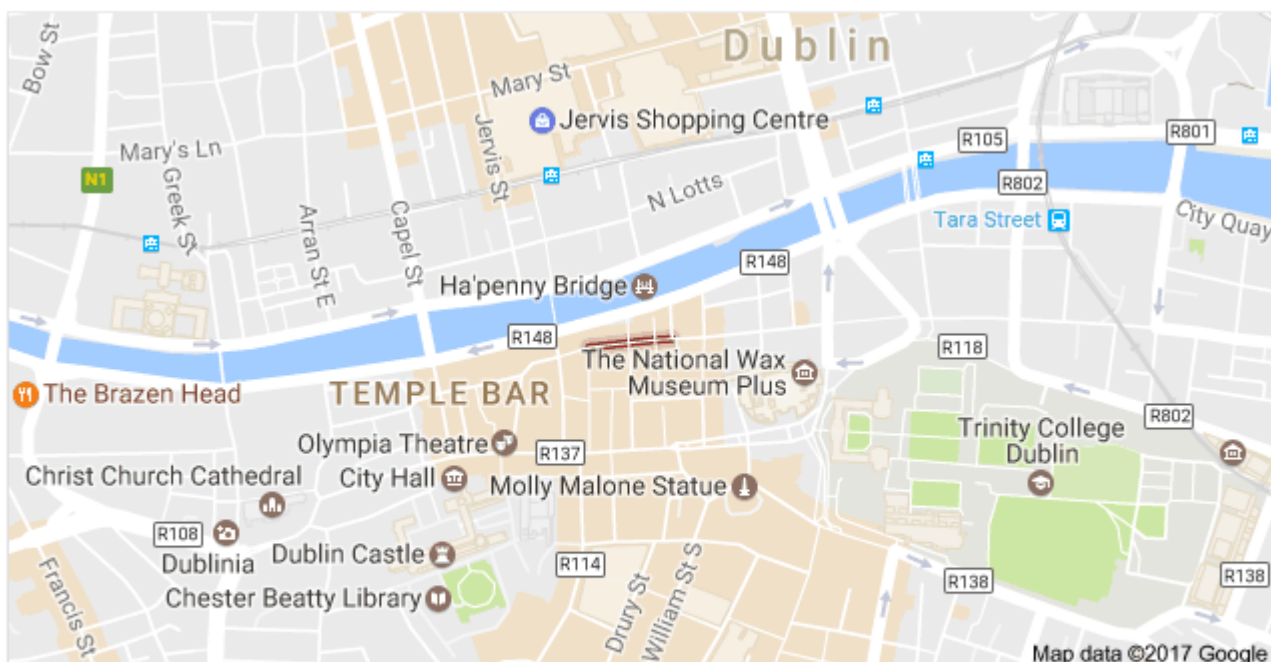
Temple Bar, Dublin