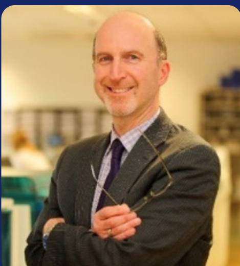
Consultant Chemical Pathologist Tallaght University Hospital