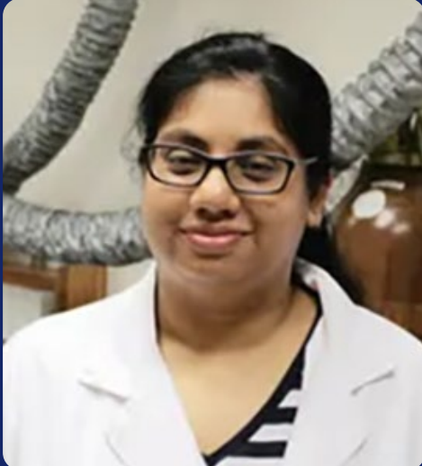
Consultant Chemical Pathologist Galway University Hospital