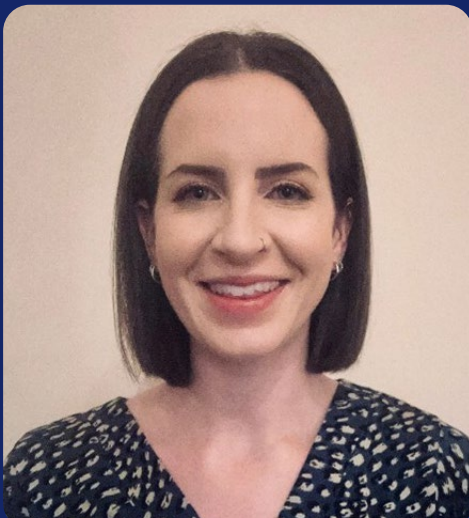
Chief Medical Scientist Blackrock Clinic