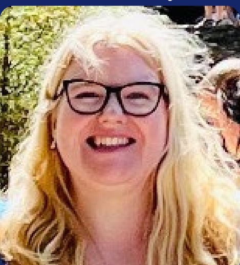
Specialist Medical Scientist CHI at Crumlin