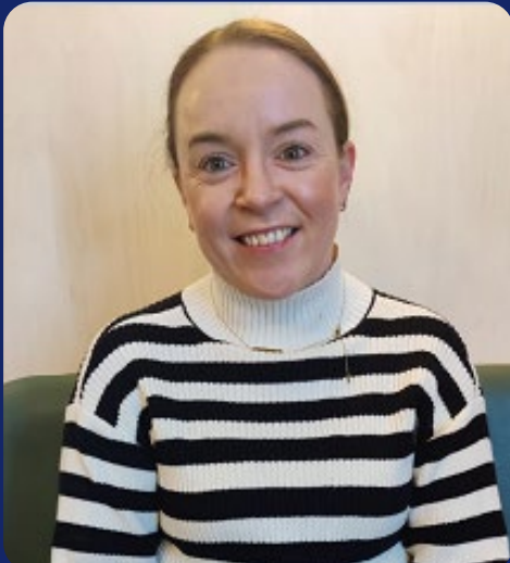
Chief Medical Scientist Tallaght University Hospital